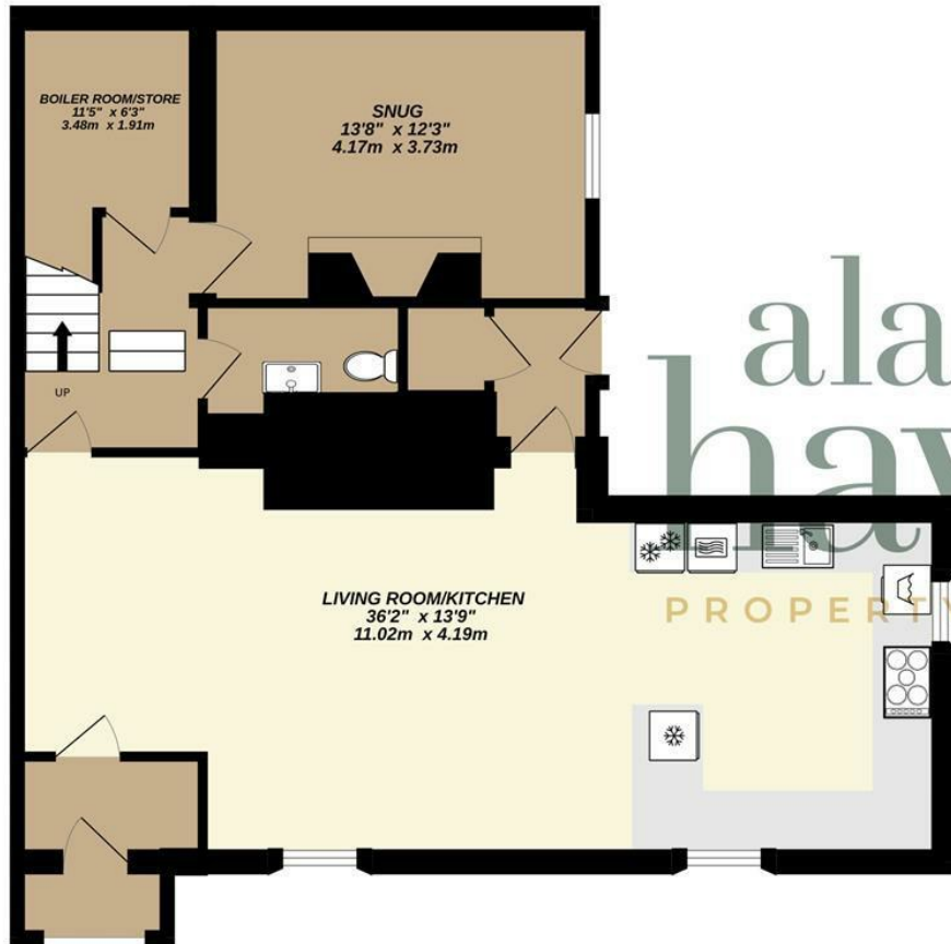
GROUND FLOOR 881 sq.ft. (81.9 sq.m.) approx.