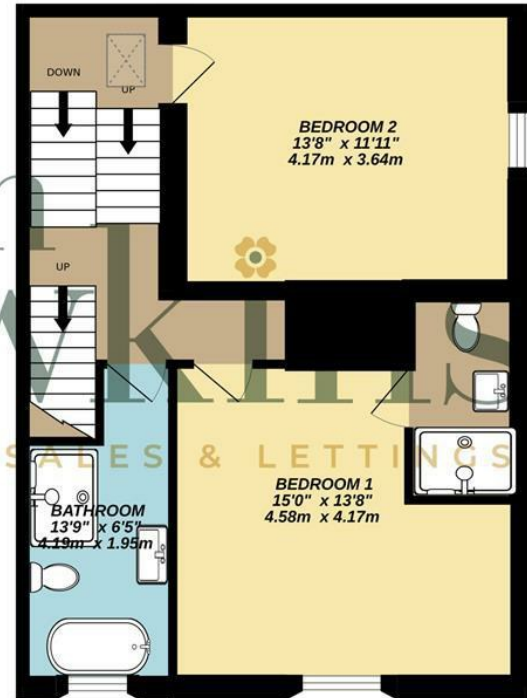
1ST FLOOR 601 sq.ft. (55.8 sq.m.) approx.